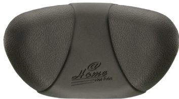
REPLACEMENT PILLOW for @Home® spas.