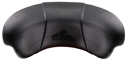
@HOME CORNER PILLOW CHARCOAL

*Also available in gray based on year of spa.