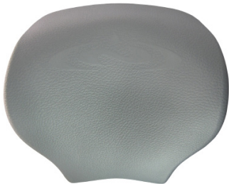
TITANIUM FLEX THERAPY PILLOW 2017+