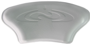
REPLACEMENT PILLOW for Reflections® / Bay™ Collection spas.